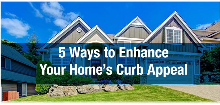
by Sharon Reynolds, Neighborhood News Staff Writer

Ever wonder what people think when they see the front of your home? In essence, your home's curb appeal is like a cover of a book leading a pathway to what's inside the home. If you're anything like me, your home's curb appeal matters. Not only will it increase your home's value, but it will also provide an enjoyable aesthetic to those around you.